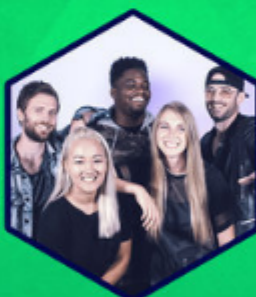
— INFLUENCERS WORSHIP —