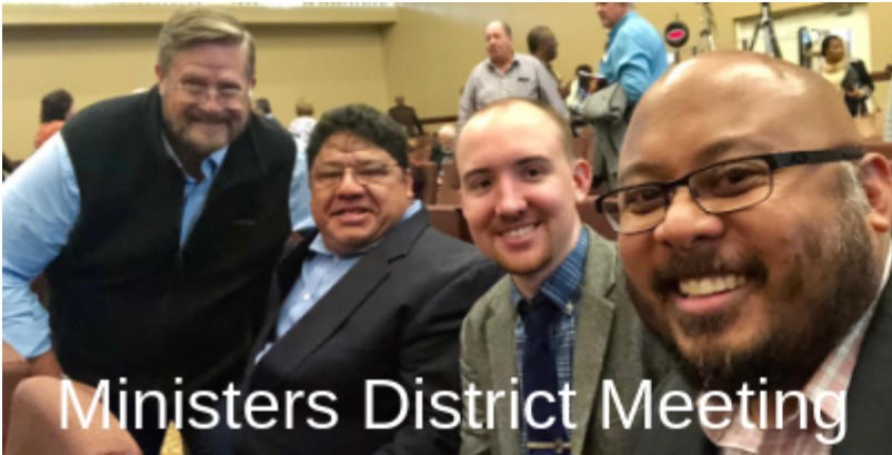
Ministers District Meeting