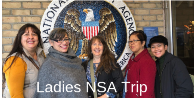
Ladies NSA Trip