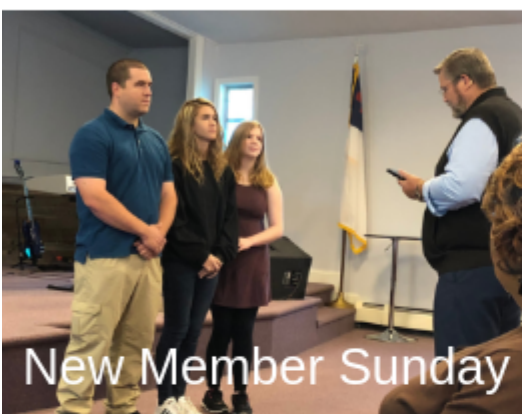
New Member Sunday