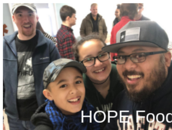
HOPE Food Distribution