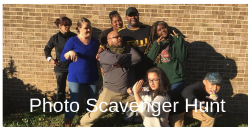
Photo Scavenger Hunt